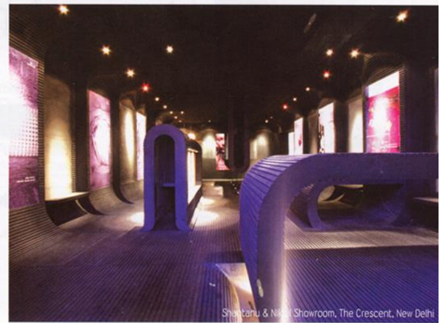
Swarovski & Nikhil Showroom, The Crescent, New Delhi