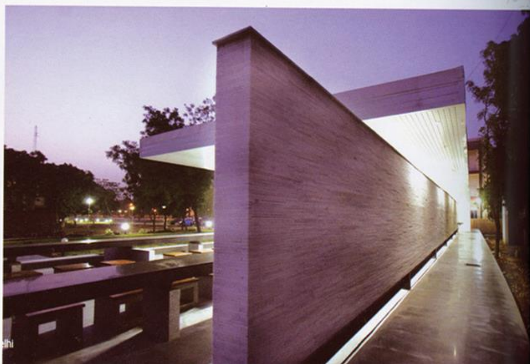
The Castro Café, Jamia Millia Islamia University, New Delhi